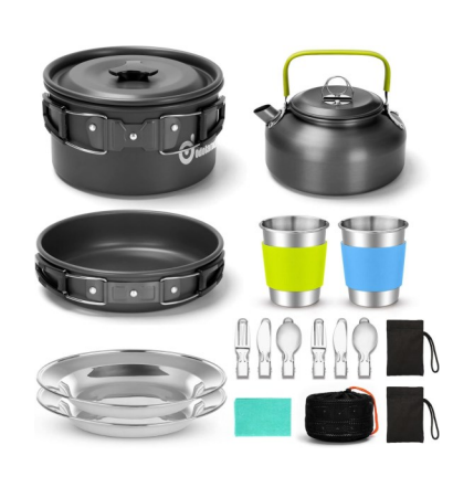
15 Piece Camping Cookware Mess Kit